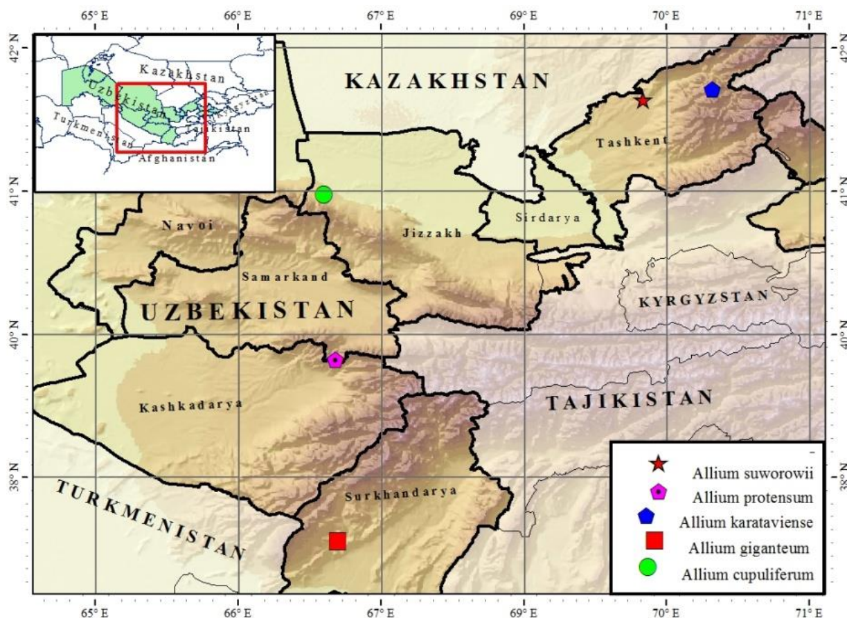
Fig. 1 - The Map of Places of Initial Material Collection

Selection volume is 40-50 generative plants. The exception was A. protensum - it was possible to find only 15 preserved fruit-bearing plants. In presence of sufficient number of plants in fruiting phase, the volume of samples on groups with various number of leaves led up to 10.